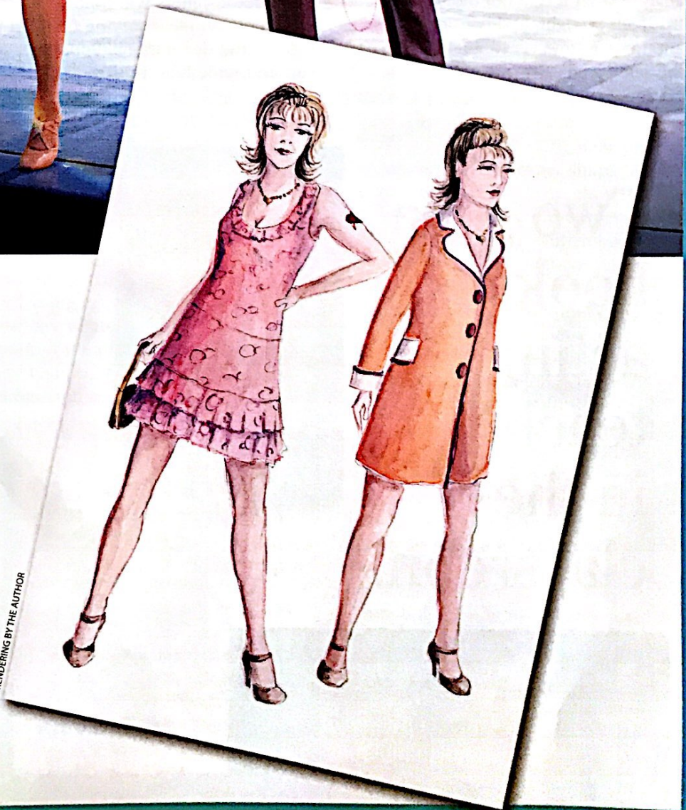
RENDERING BY THE AUTHOR

logo is also a woman in a red dress, it is a typical flapper's slip-dress covered with fringe. Other than the color, the logo image—which was created prior to the development of the final Broadway costume design—bears no resemblance to Pakledinaz's stylized work. Pakledinaz and his fellow designers developed a look for the show that was inspired by the geometric forms of the Art Deco movement popular in the 1920s. Some of Millie's costumes are printed with graphics, like the zigzag gray stripes on her yellow dress, and some use bold dimensional shapes