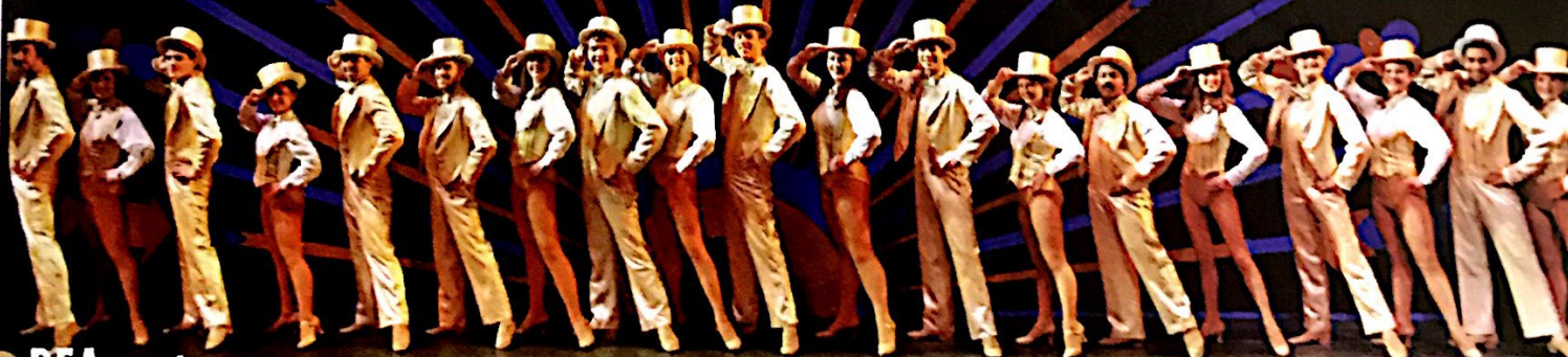
A CHORUS LINE

Specialists in Undergraduate Theatre Training for Future Professionals